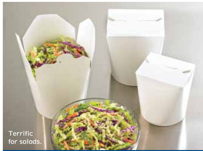
Terrific for salads.