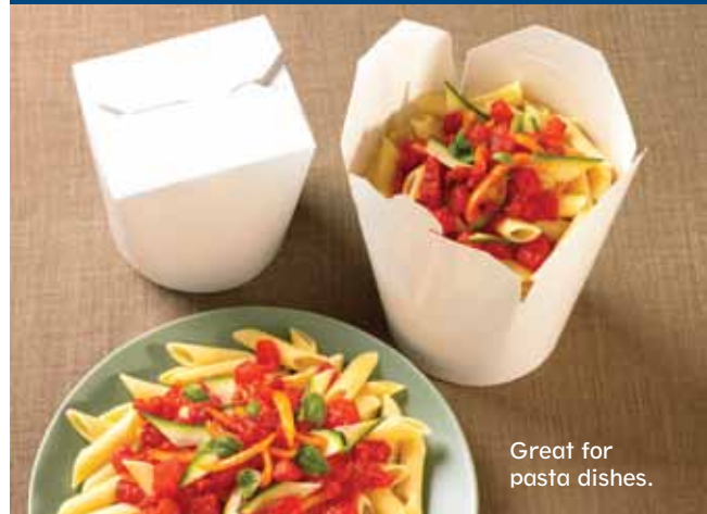
Great for pasta dishes.