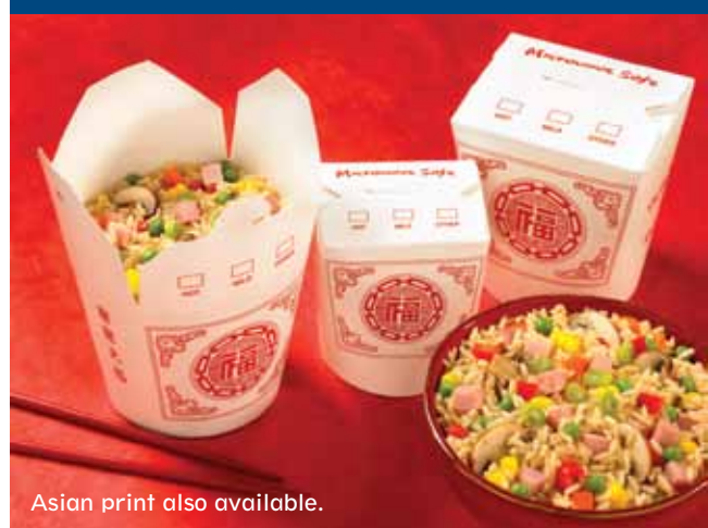
Asian print also available.